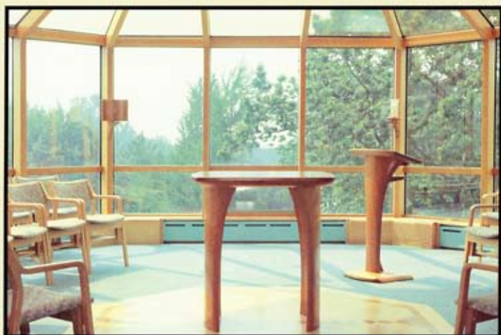
Altar and ambo, figured cherry crotchwood, Sisters of Mercy Convent, Merio, Pennsylvania, 1994.